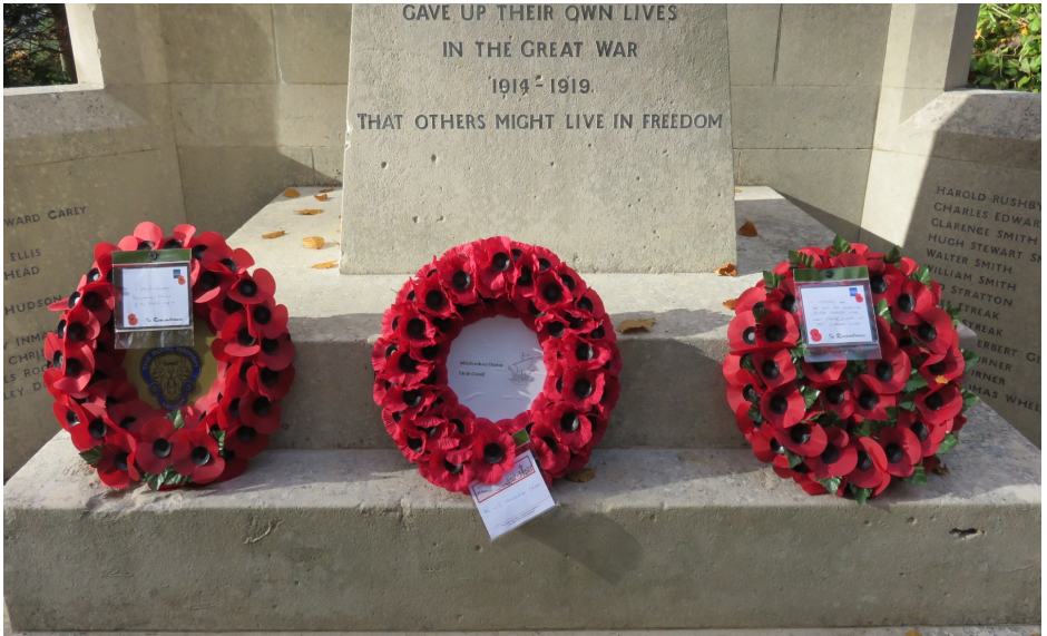
Three wreaths from Whitchurch on Thames Parish Council, Goring Heath Parish Council and The Royal British Legion.