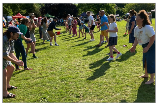
It's early days in the egg throwing