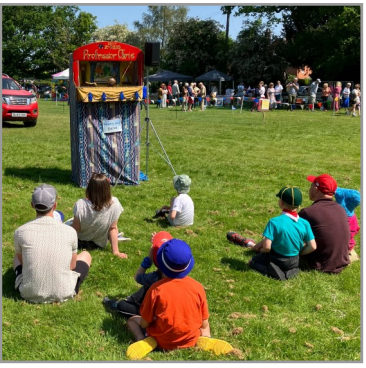
Engrossed in Punch and Judy