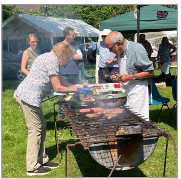
Hot work at the BBQ