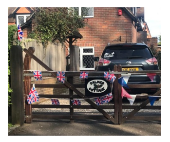
Anne got out the flags and the bunting. A special thanks to Tony for putting up the large posters!