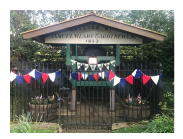
A special mention for the WI who decorated the well and the church railings.

Hilary created a red, white and blue flower display set off with bunting , crowns and a royal tea towel for added impact.