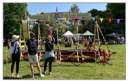
All the fun of the fair