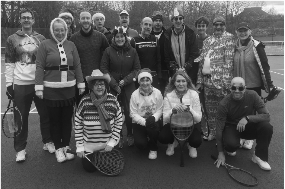
Pangbourne Tennis Club