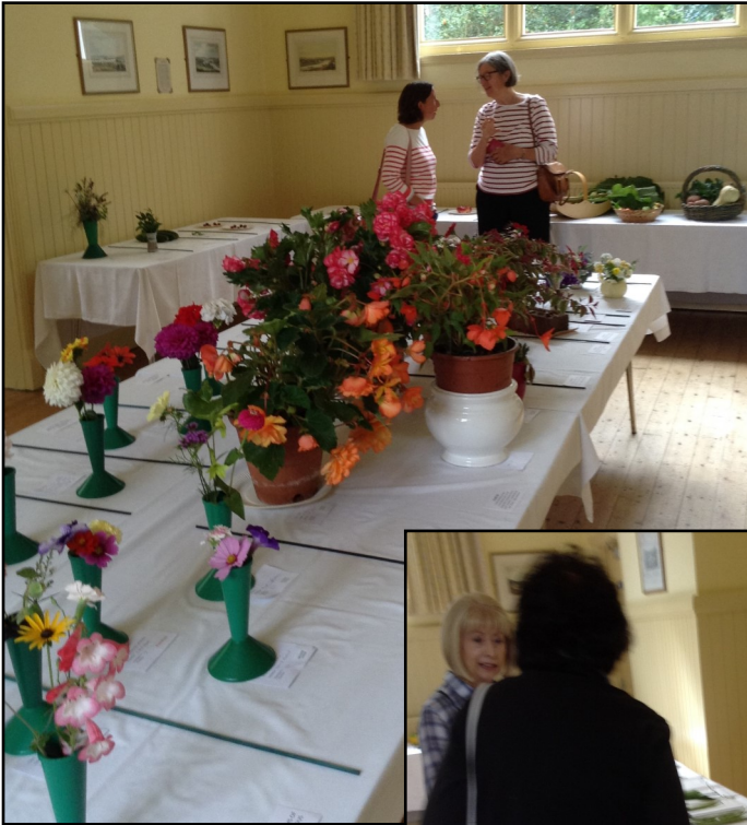
Some photographs from the Goring Heath and Whitchurch Autumn Show