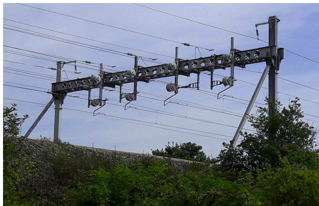
Current tension portal to support 4 single electrified wires.

Following on from RAG's last update in August, Network Rail has been undertaking work on the new electrification designs and on the visual impact that these might have on the AONB (Area of Outstanding Natural Beauty). RAG members have seen the eleven gantry designs they are considering for a retrofit, but after detailed engineering analysis and cost evaluation they plan to reduce this to three or four possible designs to put before the general public as part of their (very late) consultation process. We have not seen the short listed designs yet and we are pressing for these to include non-portal type structures such as wire-head spans and more slender T-shaped designs. We believe that using these non-portal type structures is the only way to make a meaningful improvement to the aesthetic appearance of the current bulky and over-engineered gantry design.