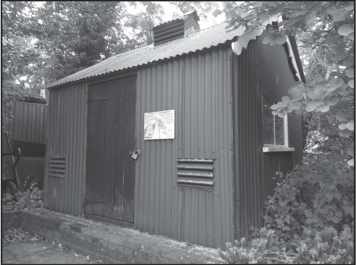
In its position sited behind the Parish Hall.