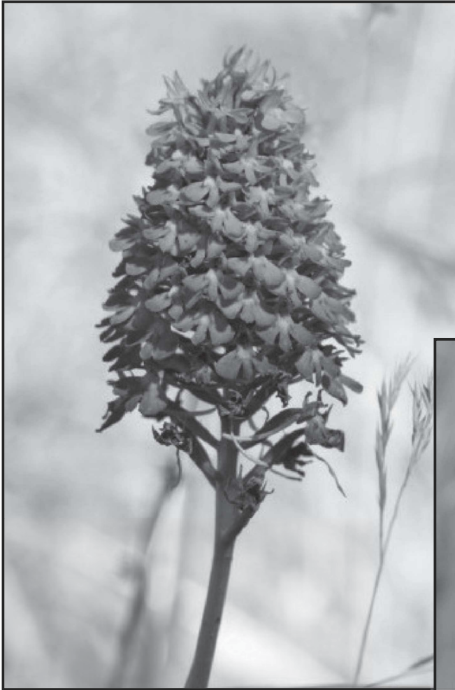
Above, a lovely purple Pyramidal Orchid Anacamptis pyramidalis