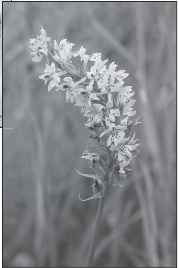
A Common Spotted Orchid Dactylorhiza fuchsii - above and left.

Apparently conditions have been good weather wise for wild orchids to grow this year as many people have reported seeing them dotted around the area. These two specimens were seen in Whitchurch Hill.