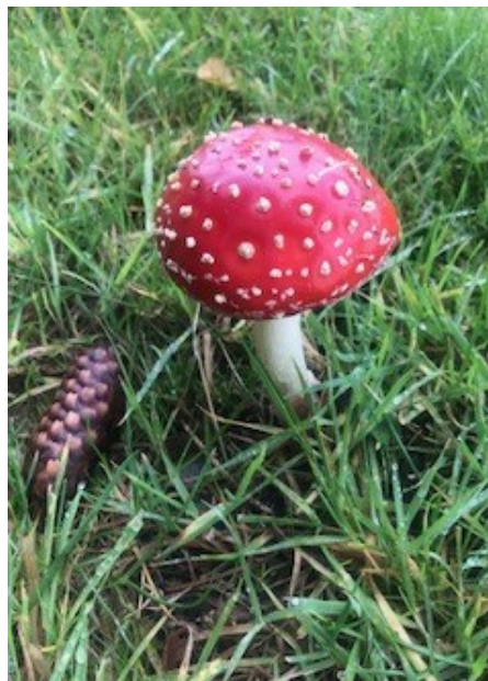
Mushroom growing near Flint House

If you see any usual wildlife, and you'd like to see a photo of it published in the Newsletter, please send it to goringheathnewsletter@gmail.com