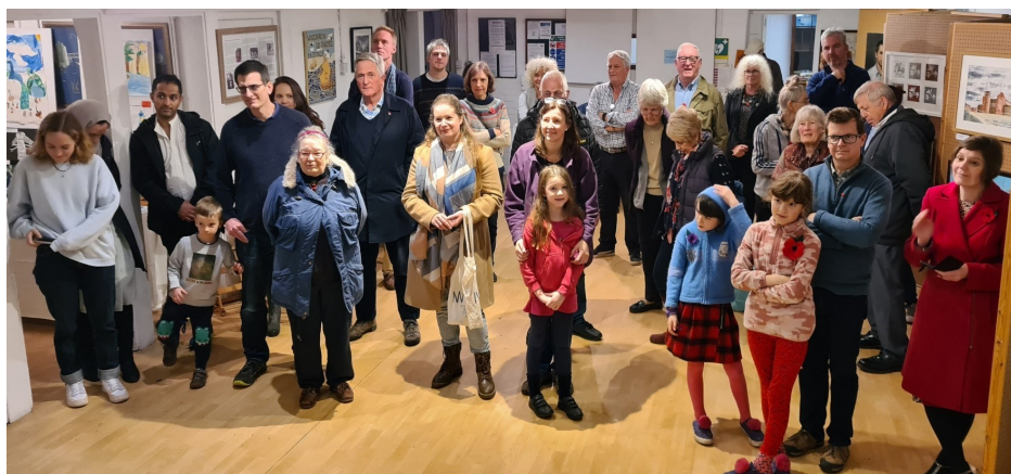
Who's won? The prize giving at the end of the weekend

There were 127 entries across the full spectrum of classes, in art, craft, photography and new media, from 65 exhibitors, both adult and young people. It was enjoyed by many visitors to the Hall over the weekend, with lots of positive feedback. Also, on the stage, the three local schools, namely Whitchurch Pre-School, the Whitchurch Primary School and the Oratory Preparatory School had set up impressive and colourful displays of school work by their students.