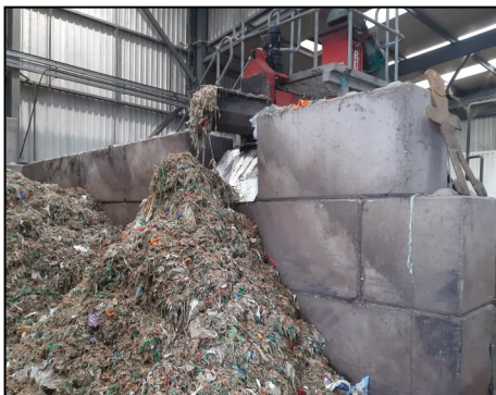
Photos from the food Waste recycling plant