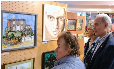
Visitors enjoying the exhibits