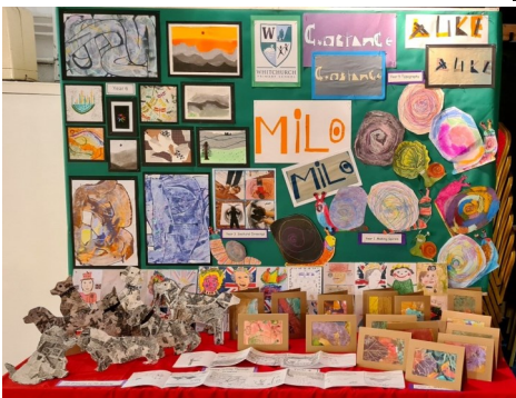
(right) Display of artwork from Whitchurch Primary School